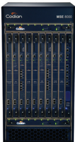
MSE 8000 Chassis

High-capacity voice and videoconferencing media services engine. This powerful, fault tolerant solution is ideal for the large scale communication needs of large enterprises and service providers requiring a high-availability, high-performance, scalable solution.